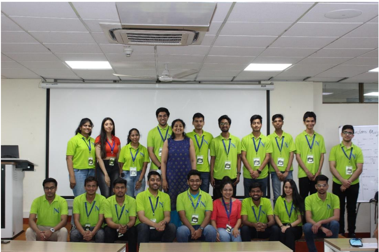
The student council and members 2021-22

After a long pause, the Quiz Society Sangyaan conducted its first offline event when the campus was opened post-pandemic, for the students. The event participation rate was an outstanding success as 450+ people registered across 4 different Quizzes, spanning 2 days. As a part of the Quiz festival the following events were organised: Business and Economics Quiz, Fandom Quiz, General Quiz, Cricket Quiz.