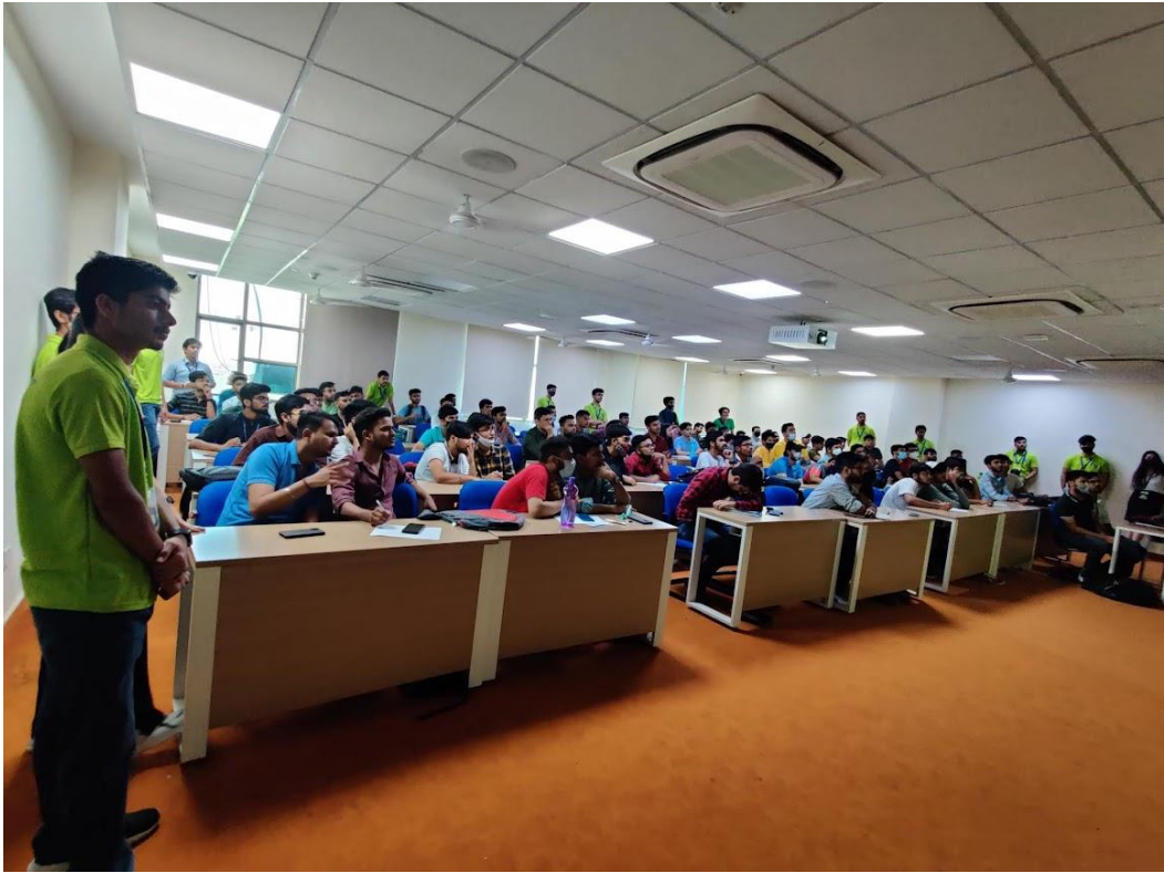
Quiz event in progress