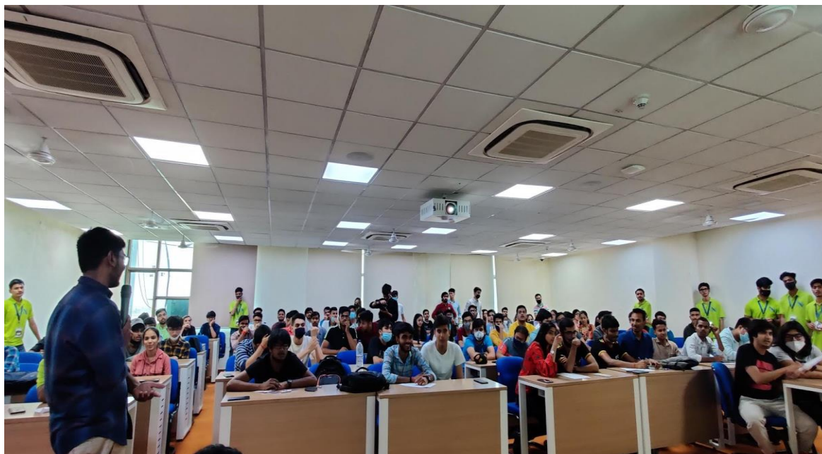
Alumni Quiz being conducted