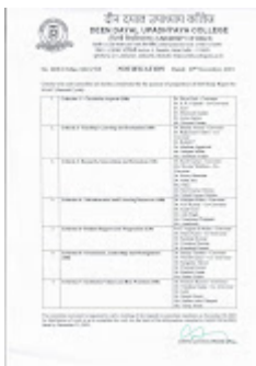
IMG-20211129-WA0012 (2).jpg 114K