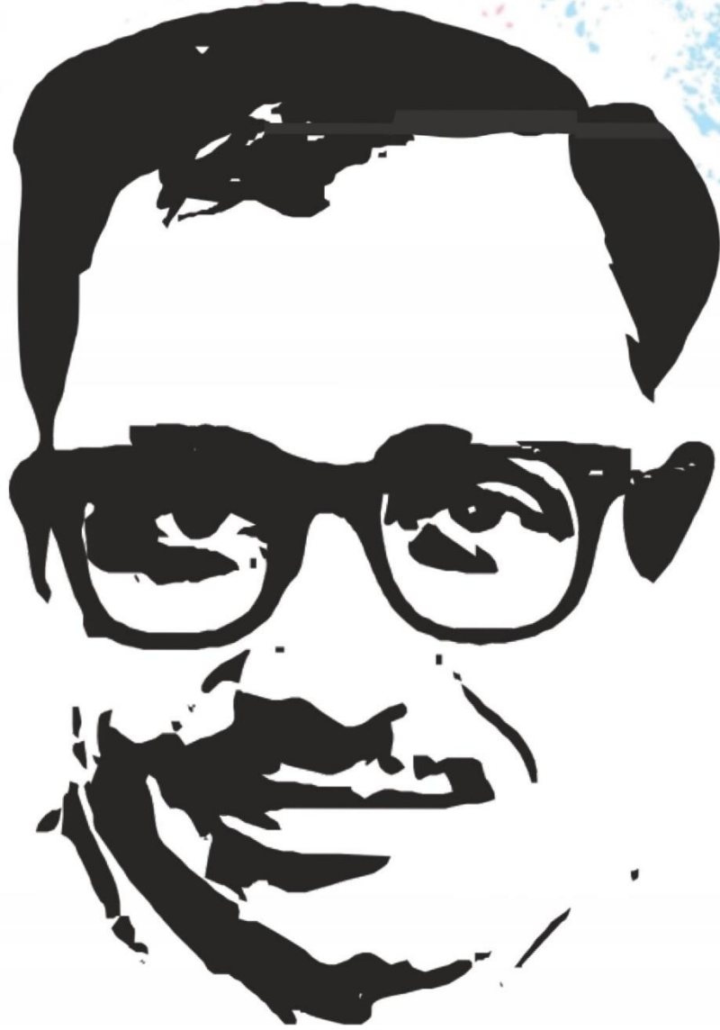
Pandit Deendayal Upadhyaya (1916-1968)