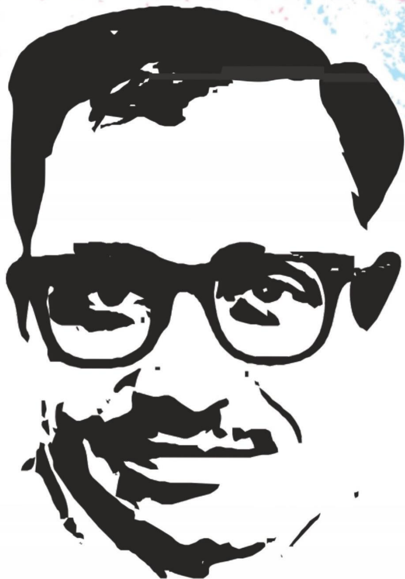
Pandit Deendayal Upadhyaya (1916-1968)