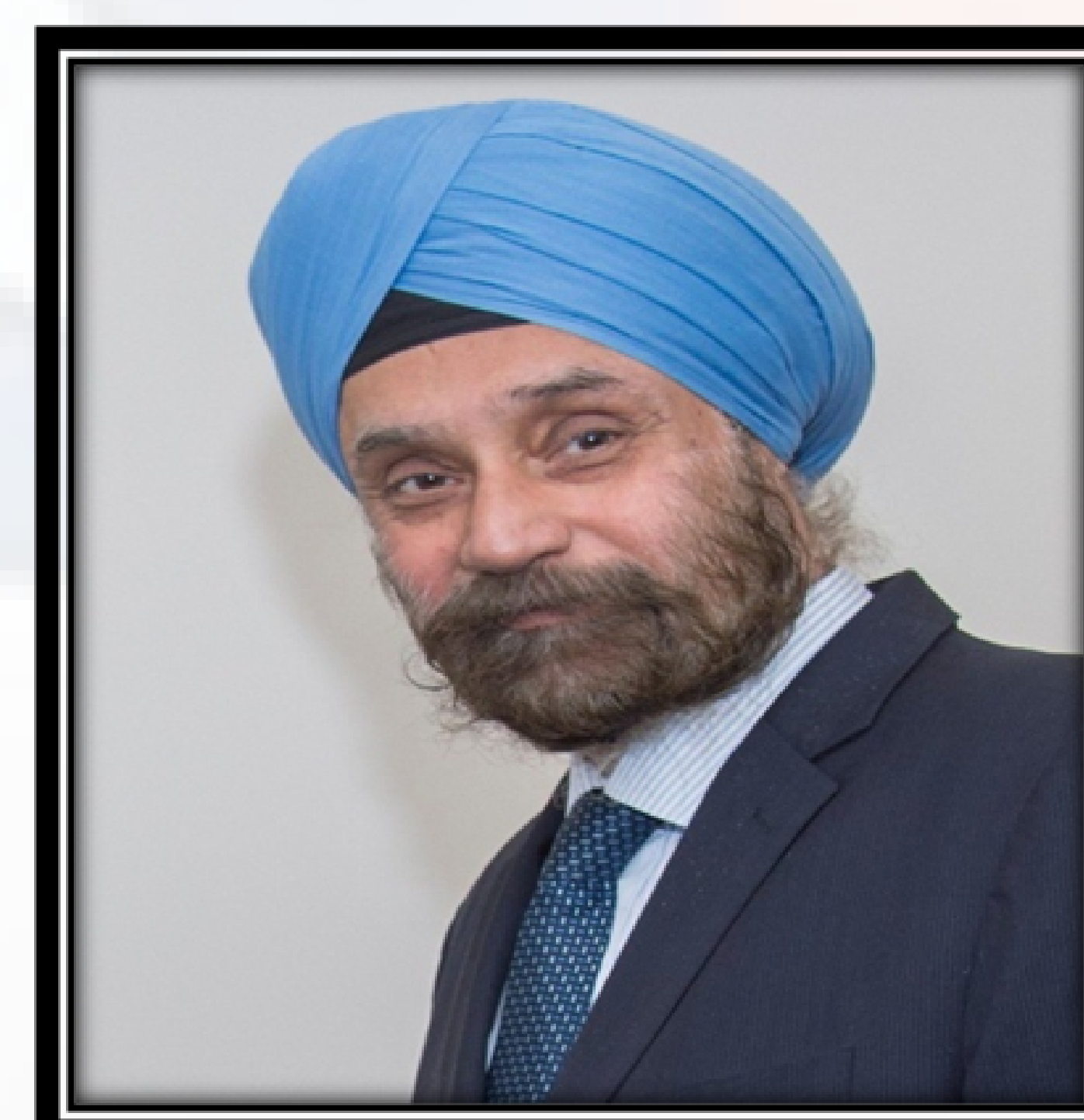
Mr. Navtej Singh Sarna